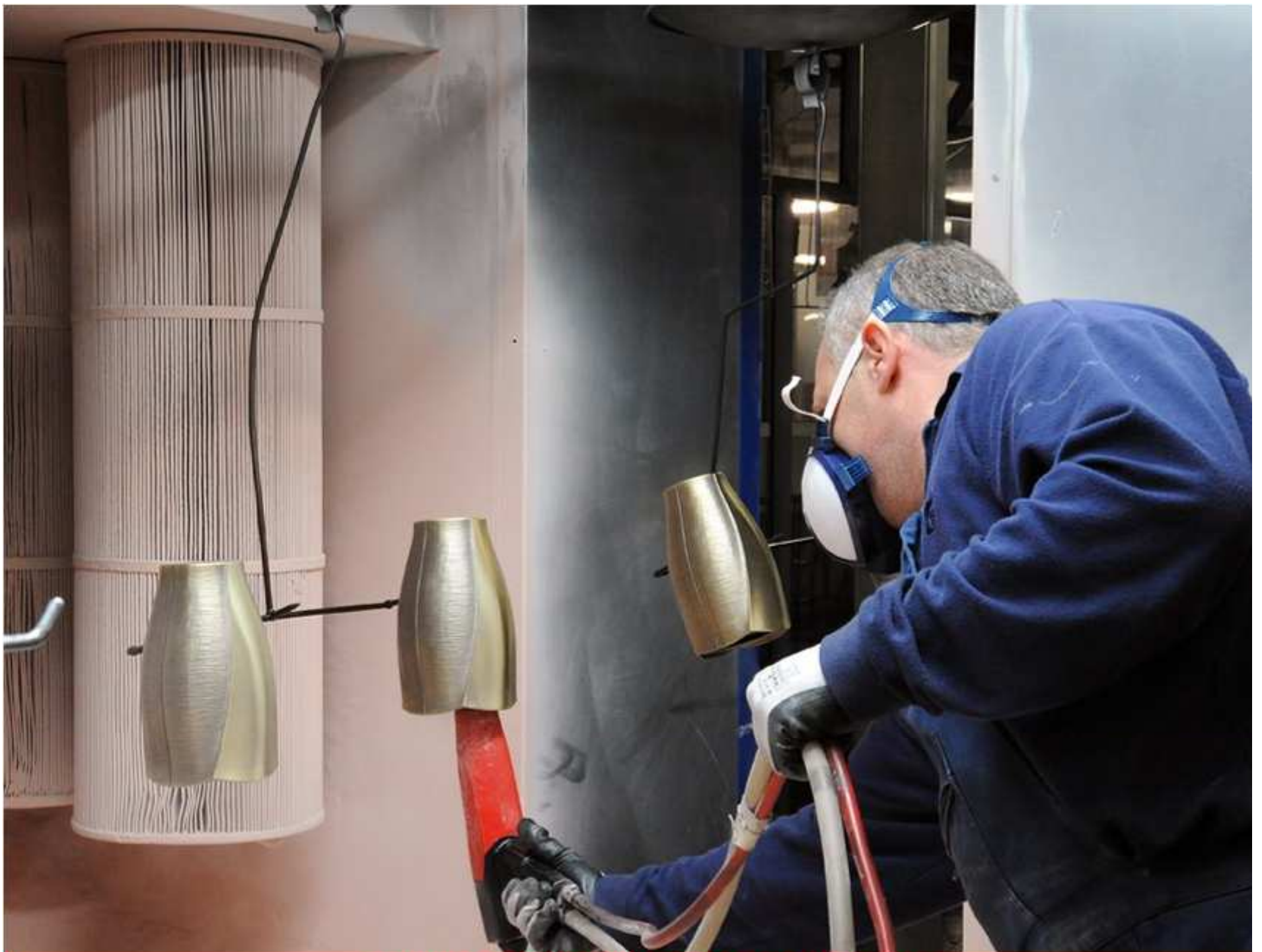
POWDER COATING DEPARTMENT