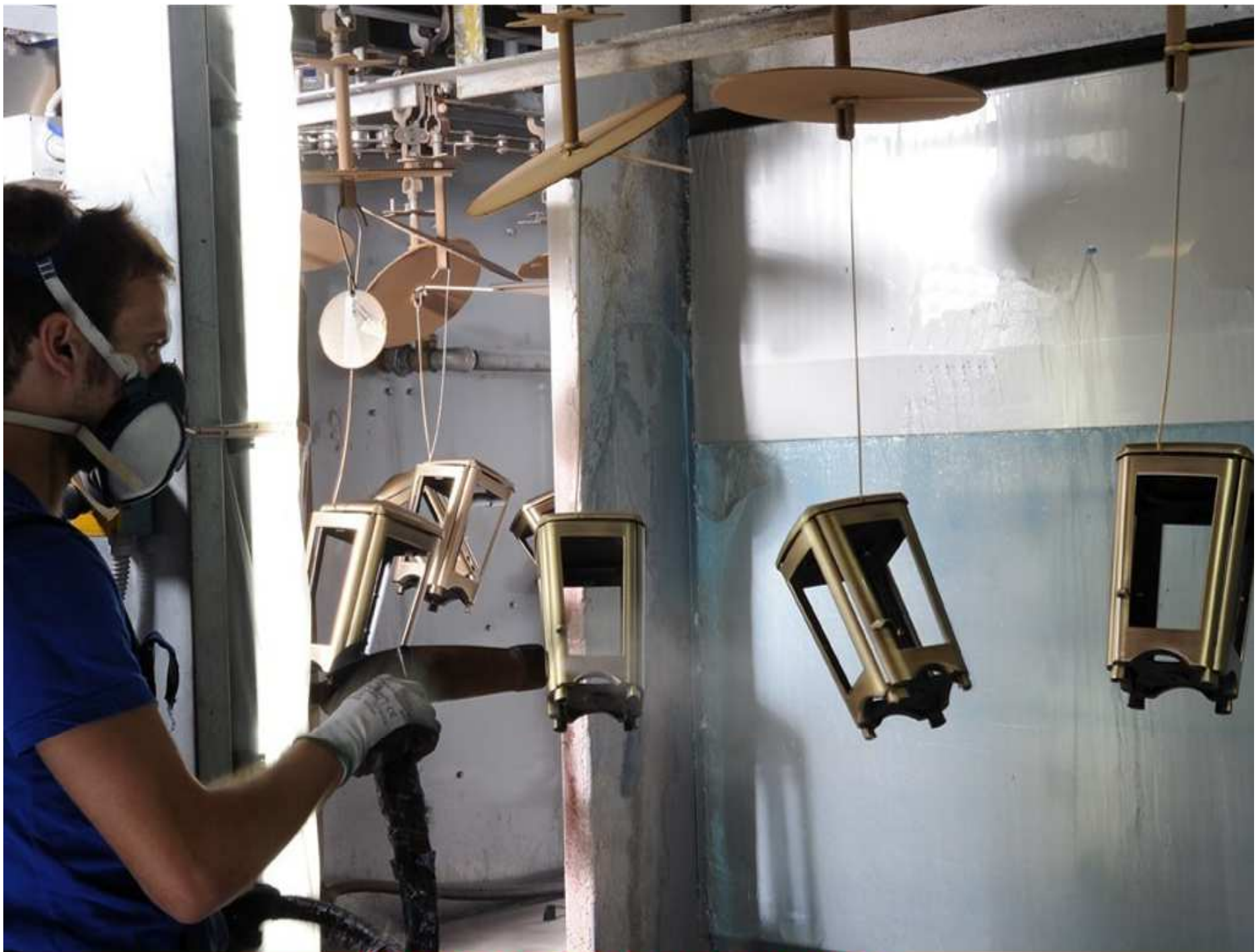
LIQUID COATING DEPARTMENT