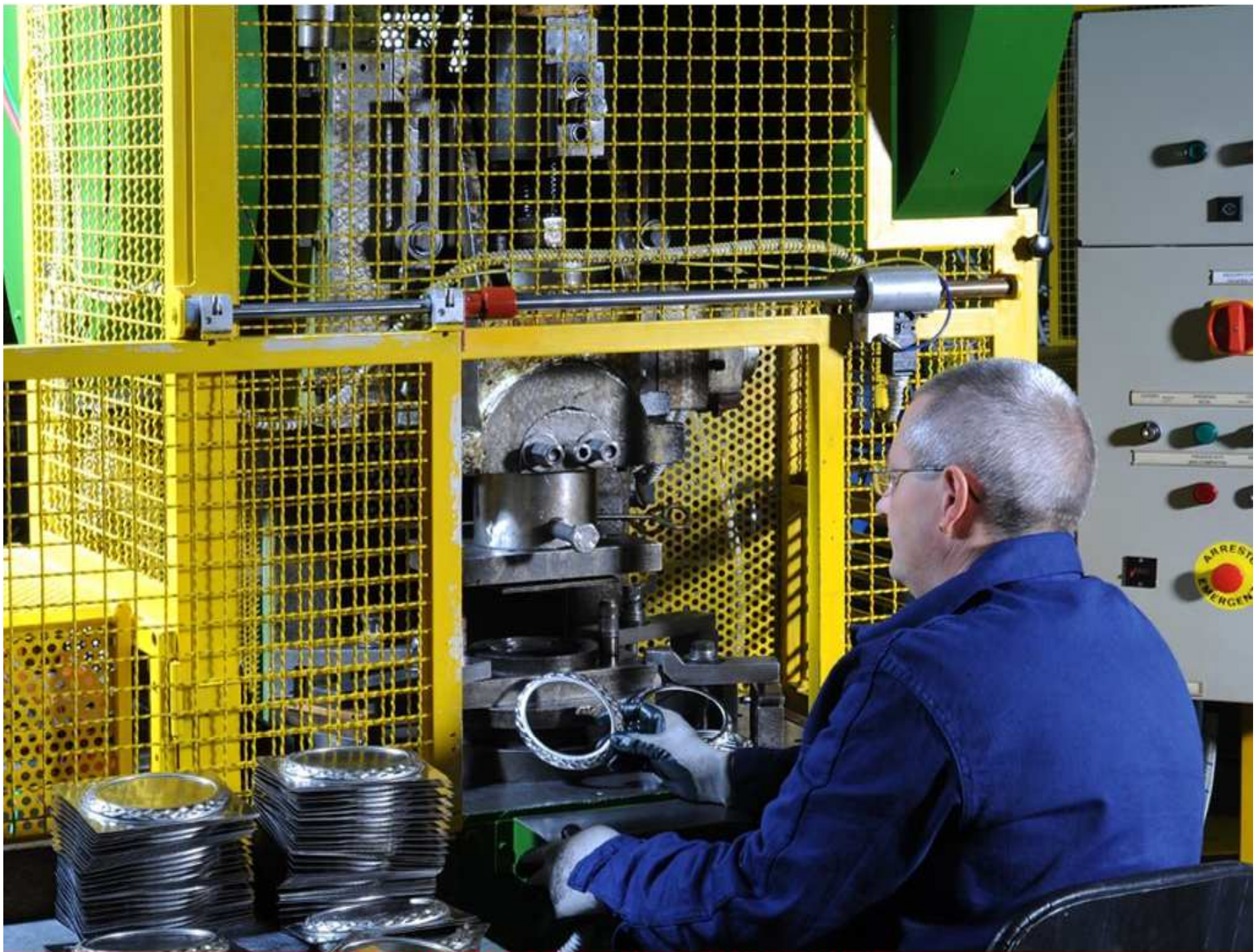
STAINLESS STEEL DEPARTMENT