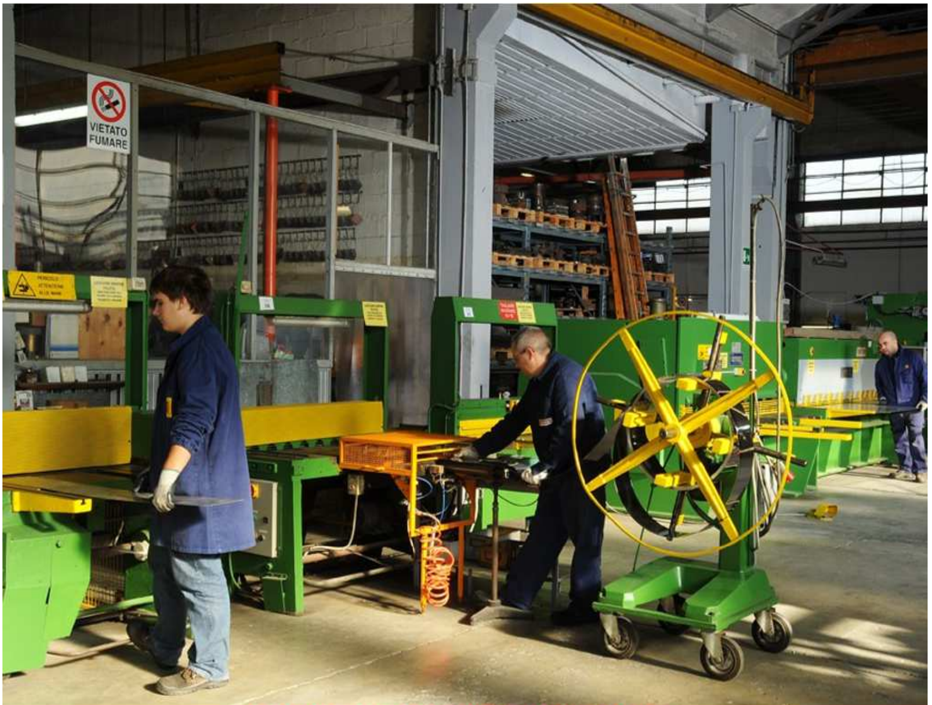
STAINLESS STEEL DEPARTMENT