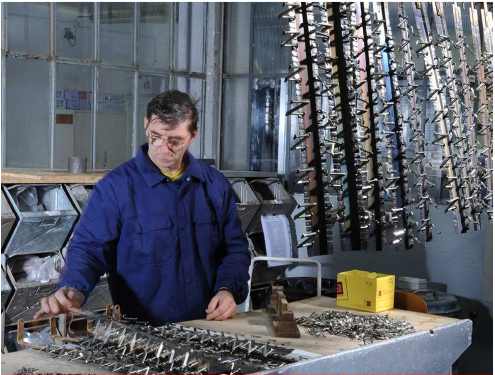
STAINLESS STEEL DEPARTMENT