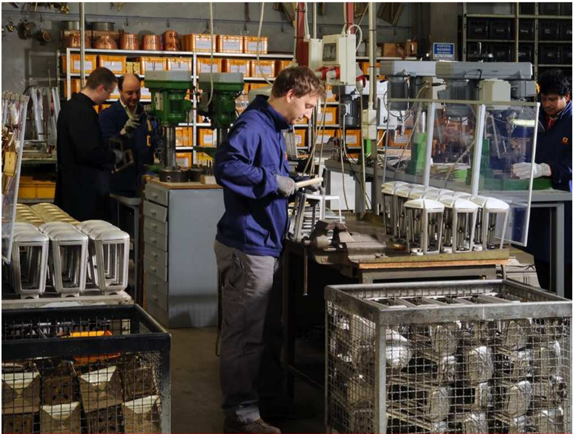
ASSEMBLY BRONZE DEPARTMENT