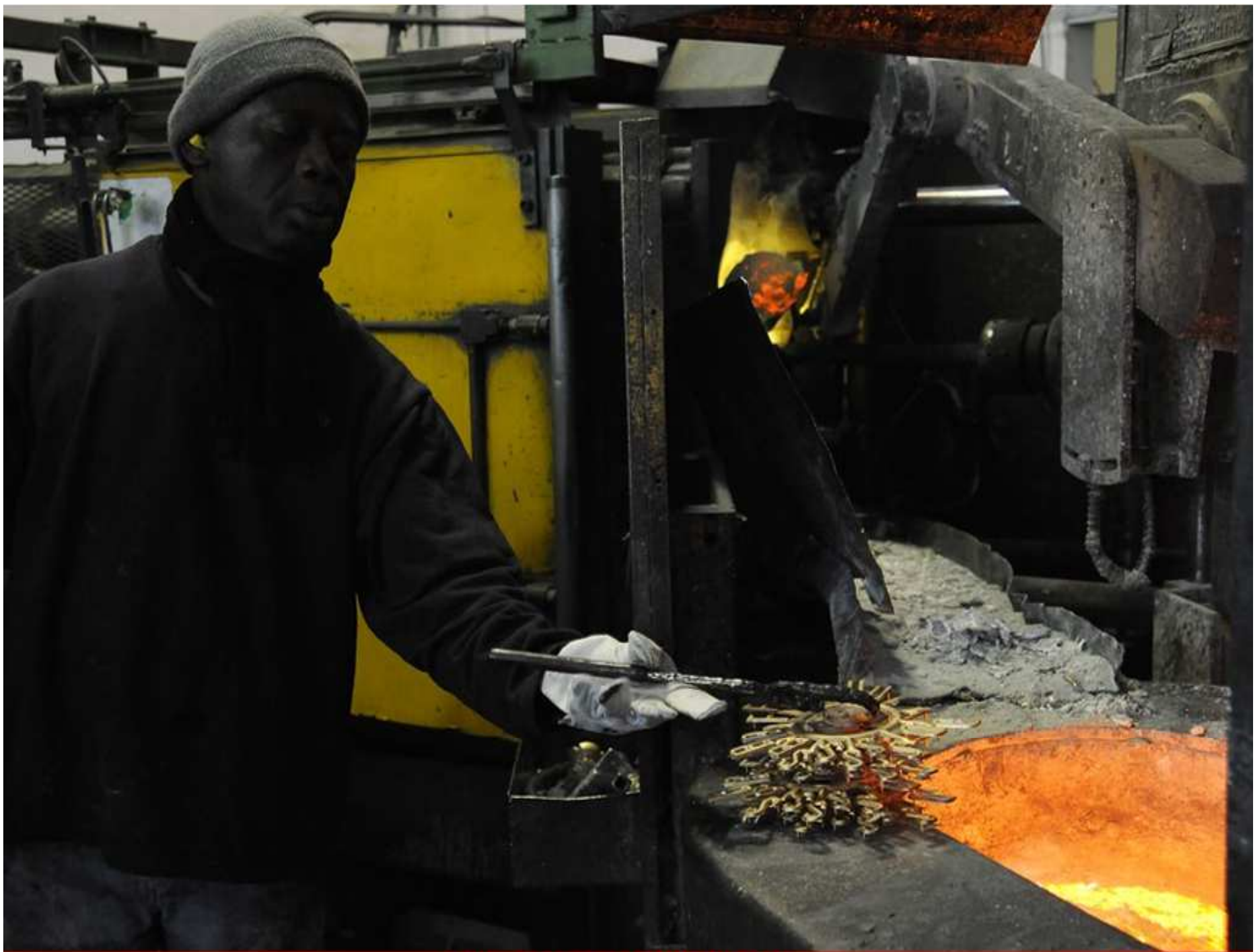
DIE CAST FOUNDRY