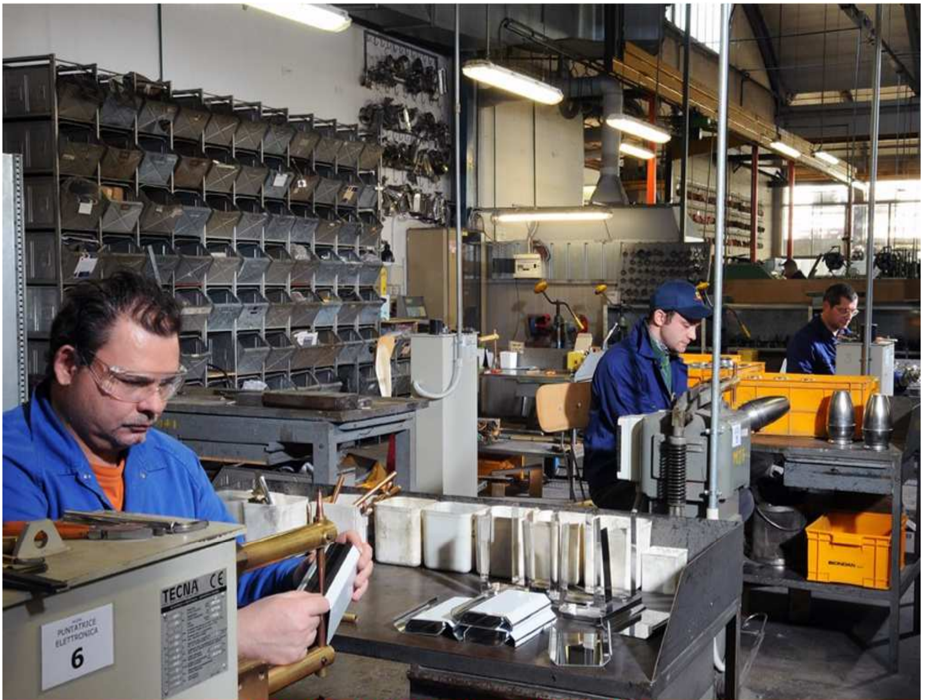
STAINLESS STEEL DEPARTMENT