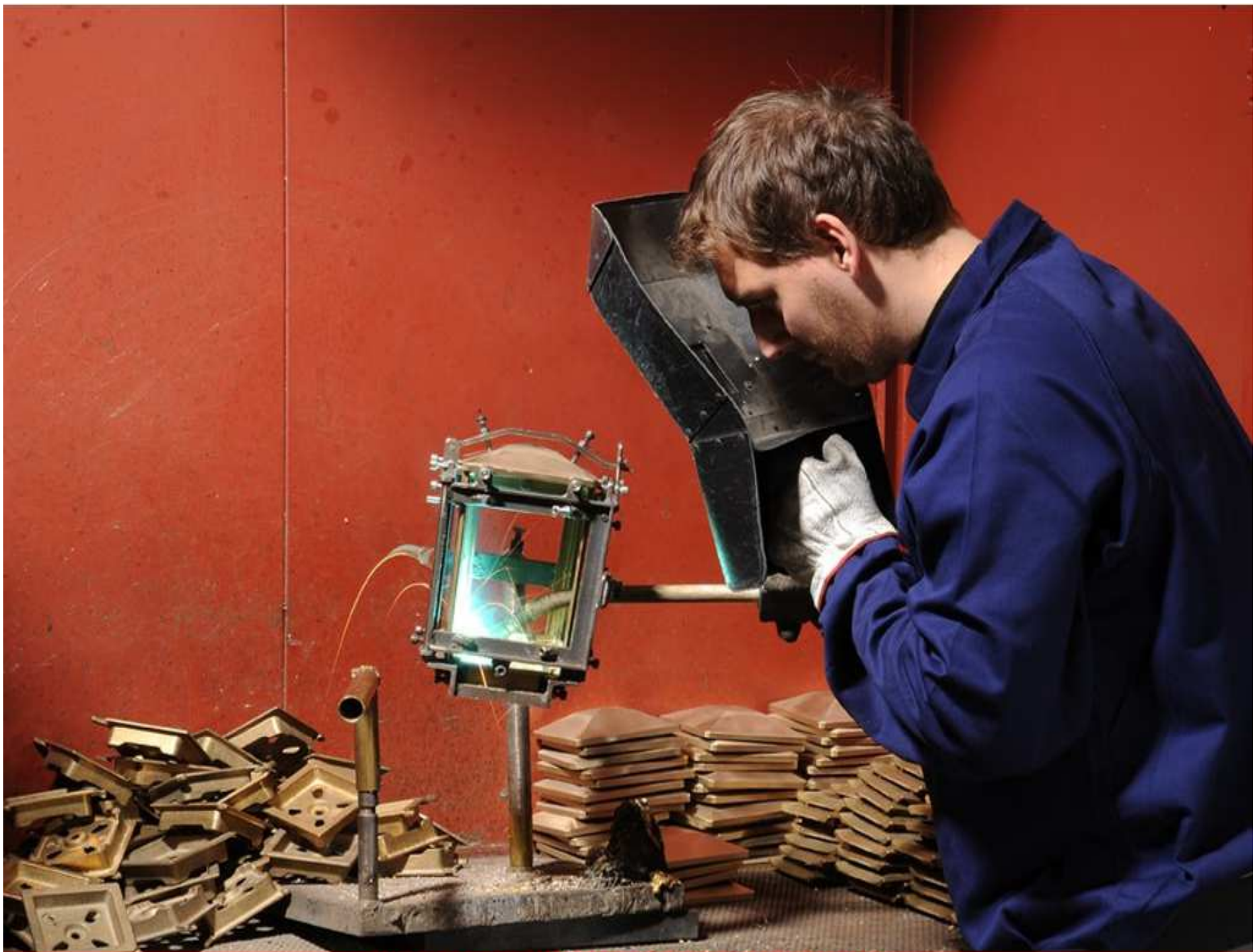
ASSEMBLY BRONZE DEPARTMENT