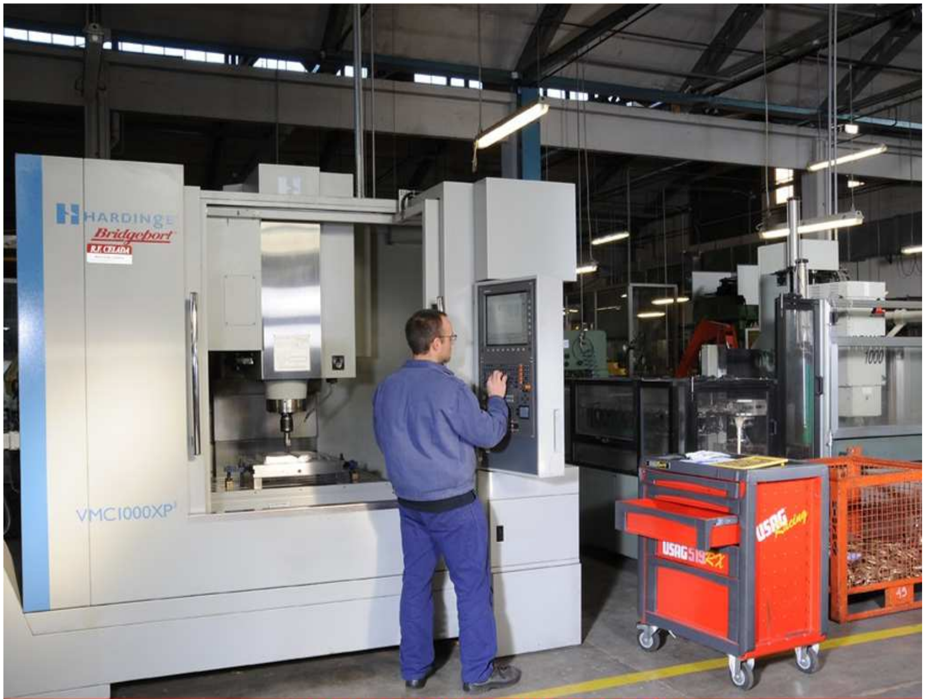
MOULD MAKING DEPARTMENT