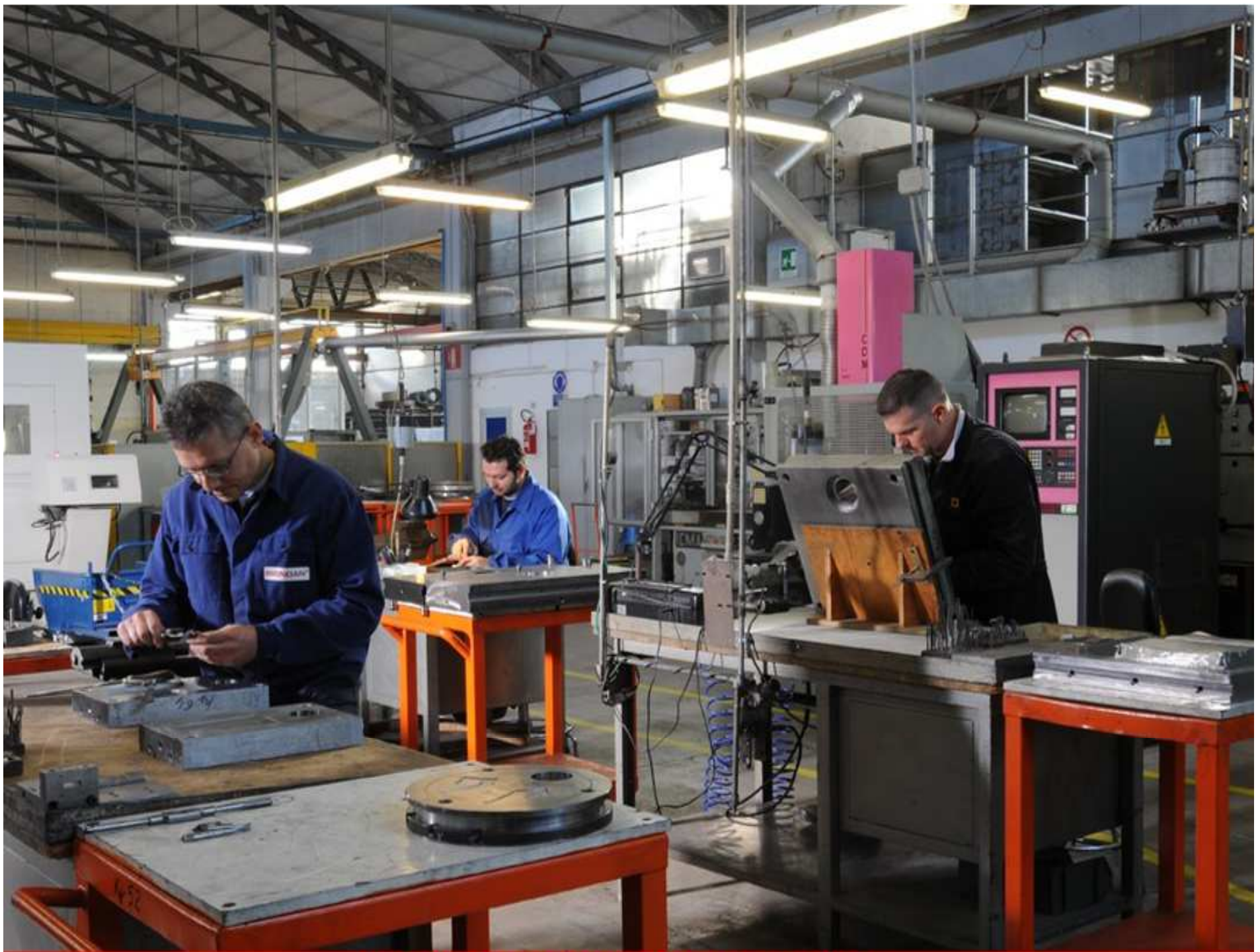
MOULD MAKING DEPARTMENT