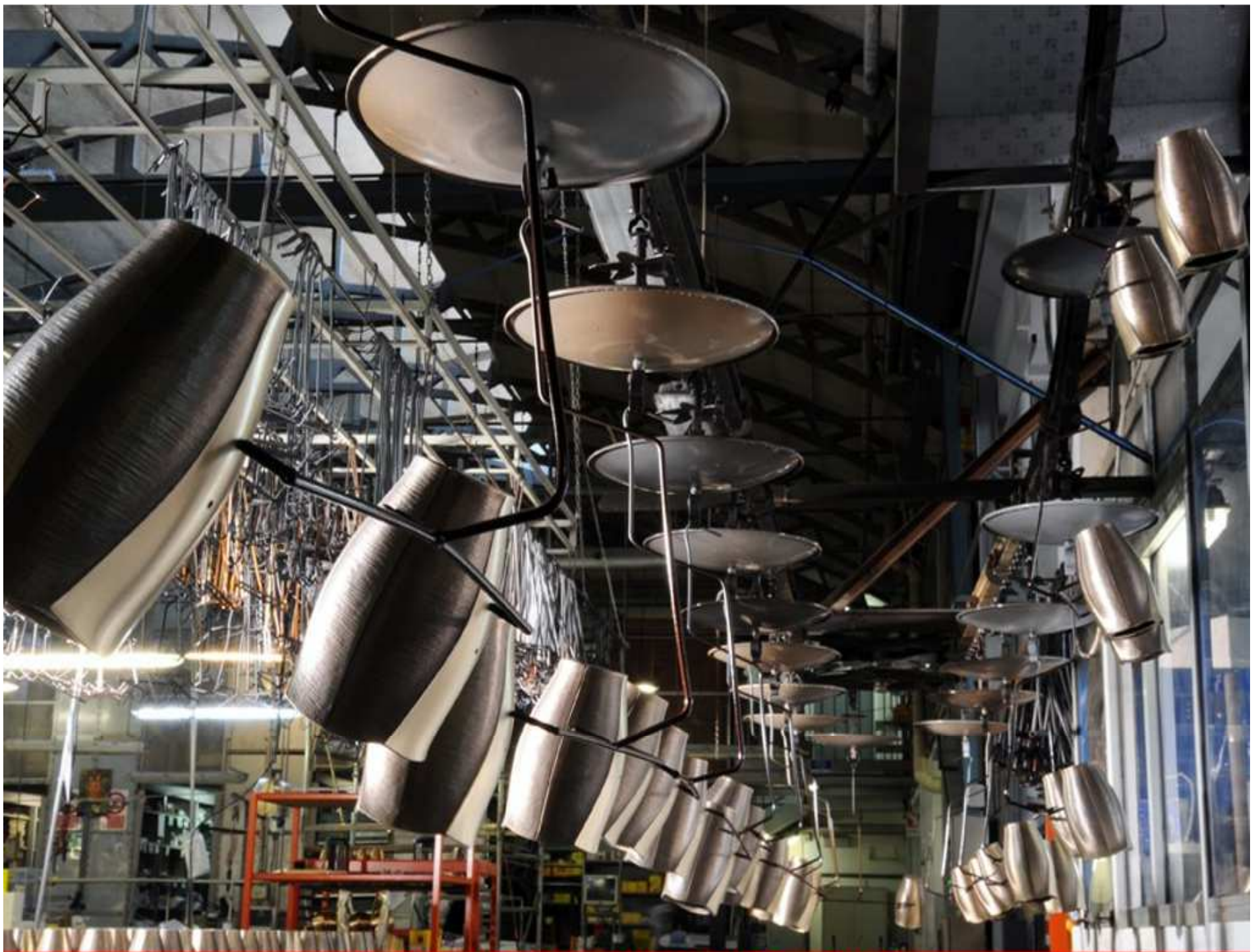
POWDER COATING DEPARTMENT