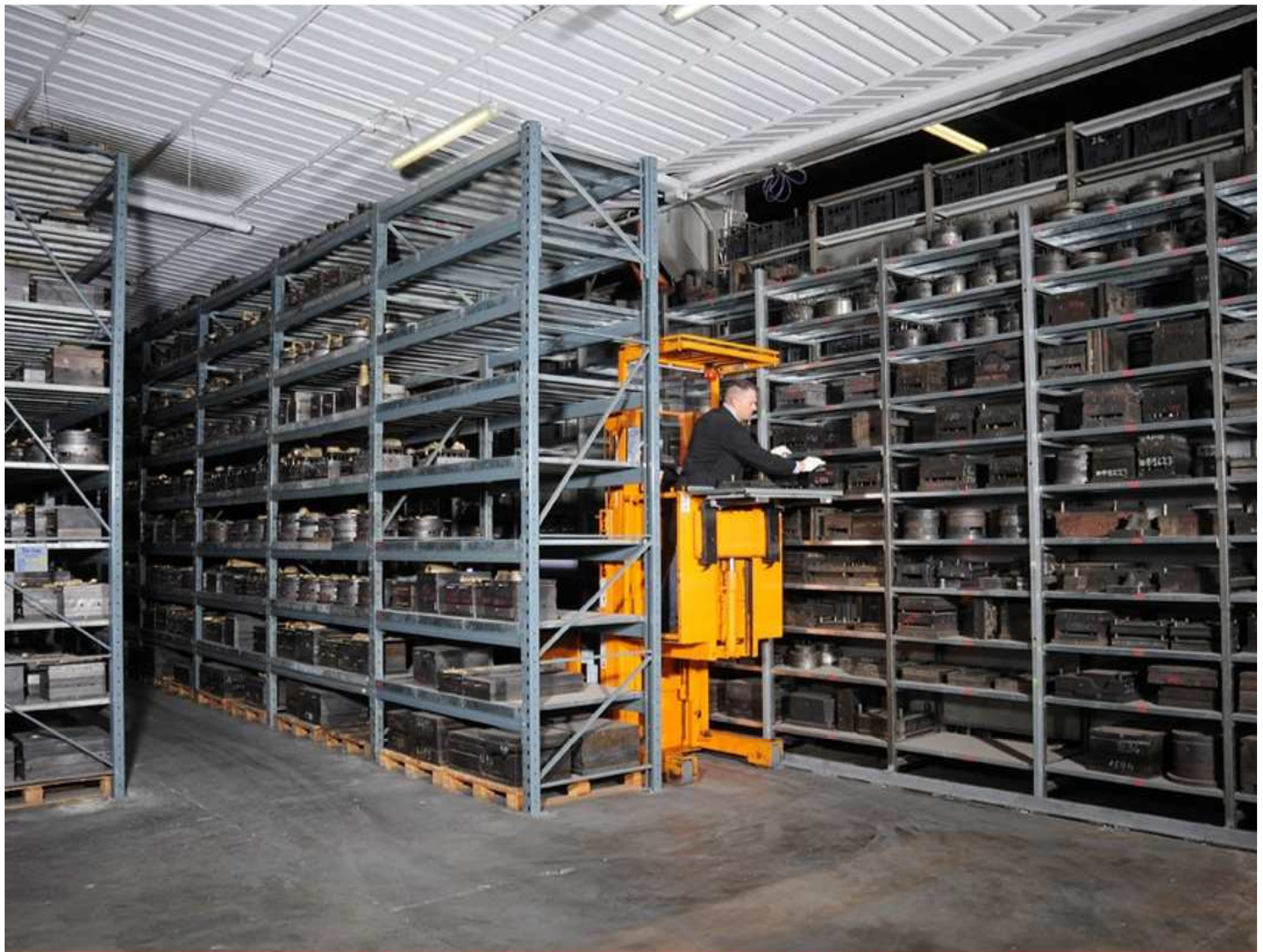
MOULD MAKING DEPARTMENT