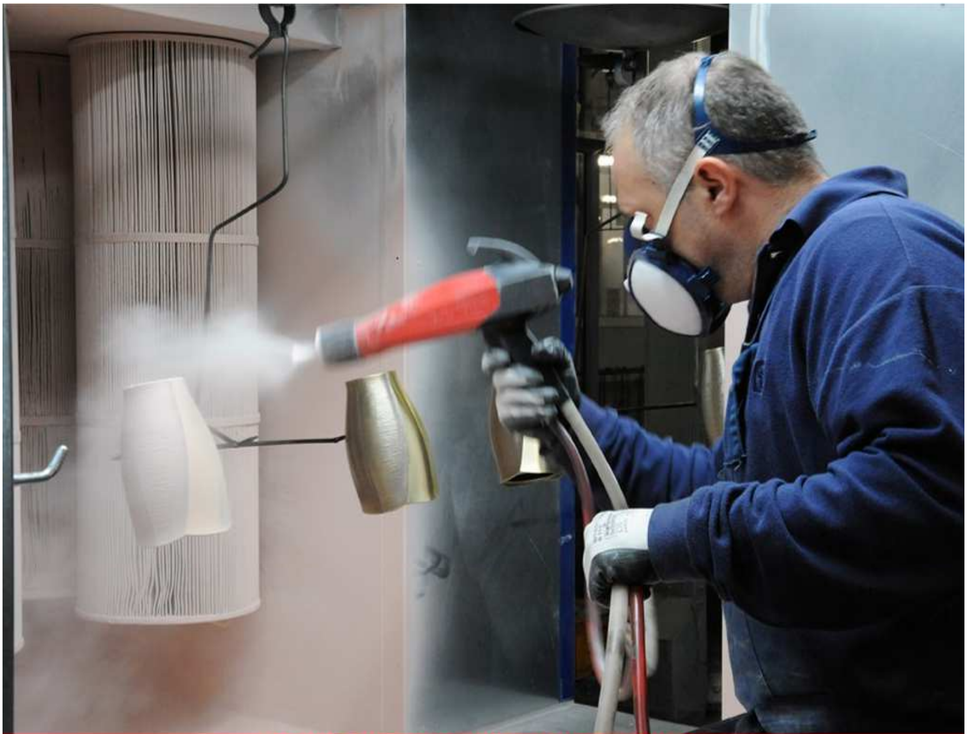
POWDER COATING DEPARTMENT