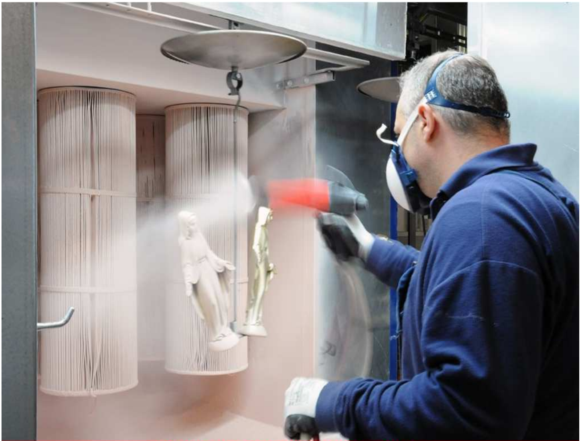
POWDER COATING DEPARTMENT