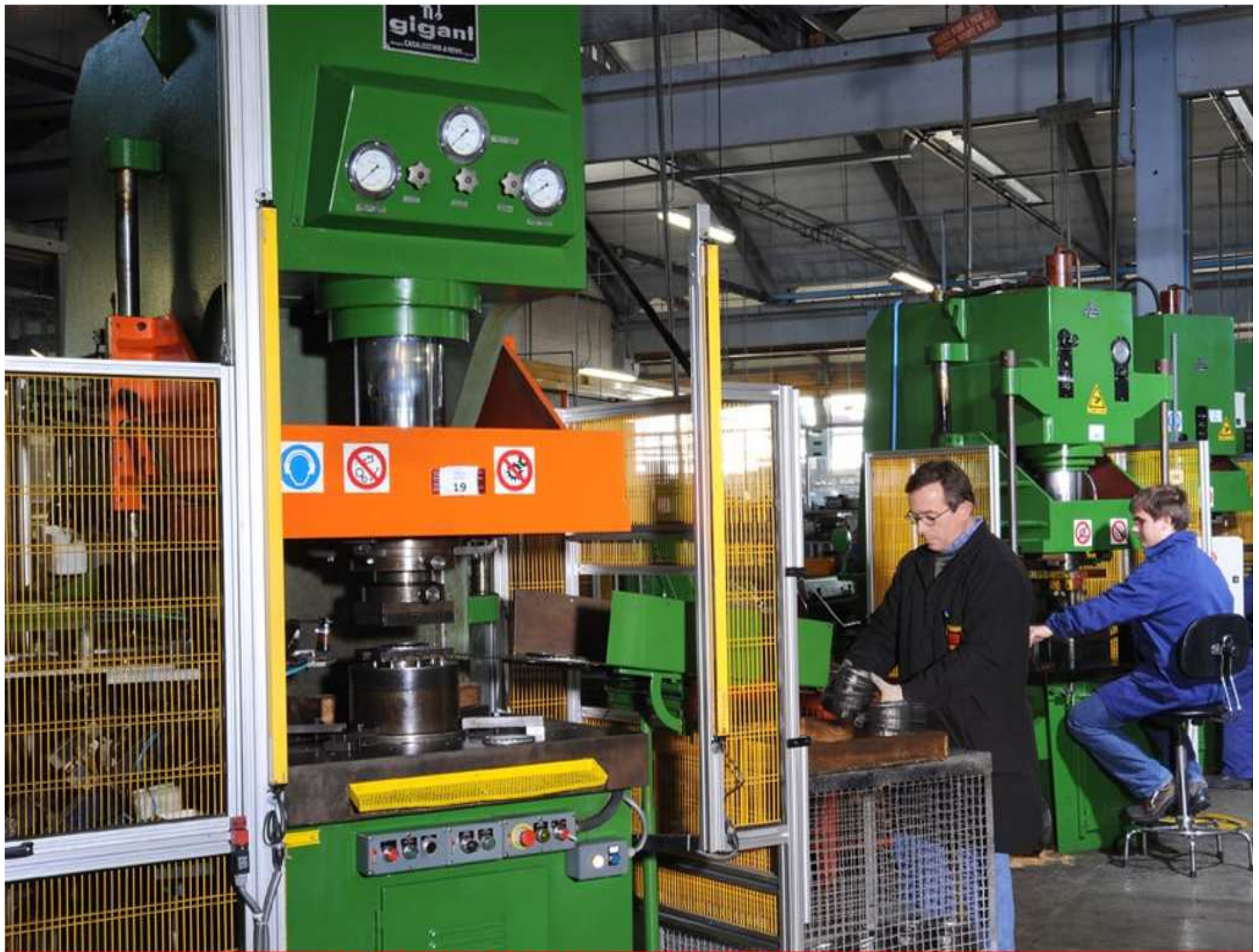
STAINLESS STEEL DEPARTMENT