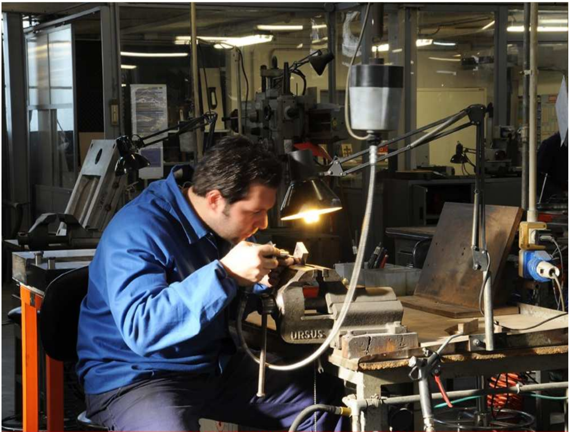
MOULD MAKING DEPARTMENT