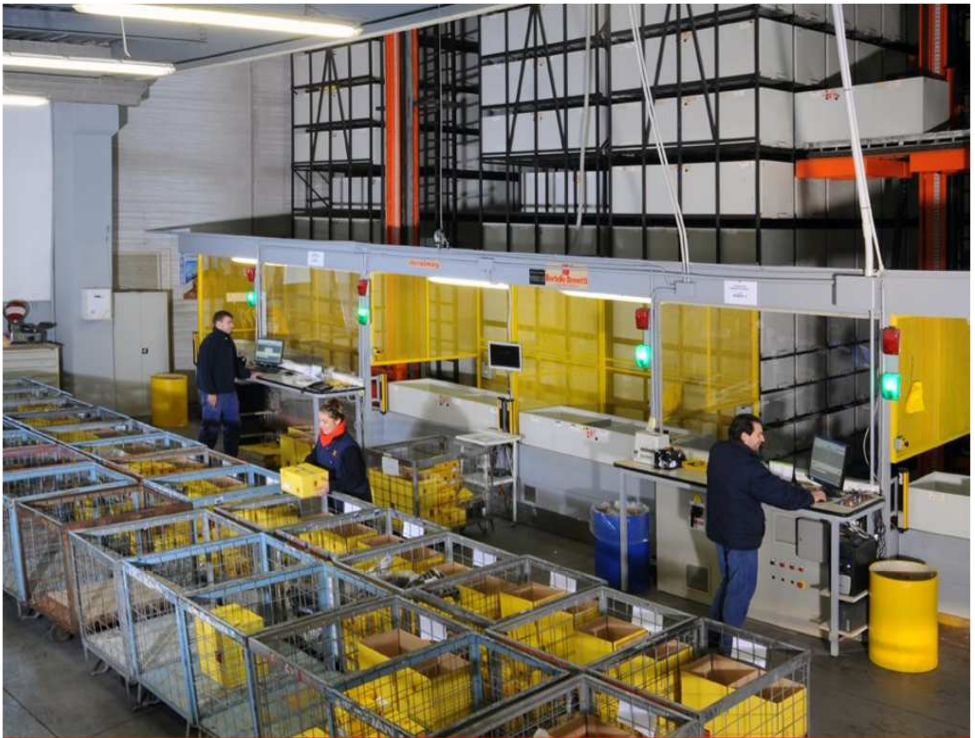
WAREHOUSE / SHIPPING