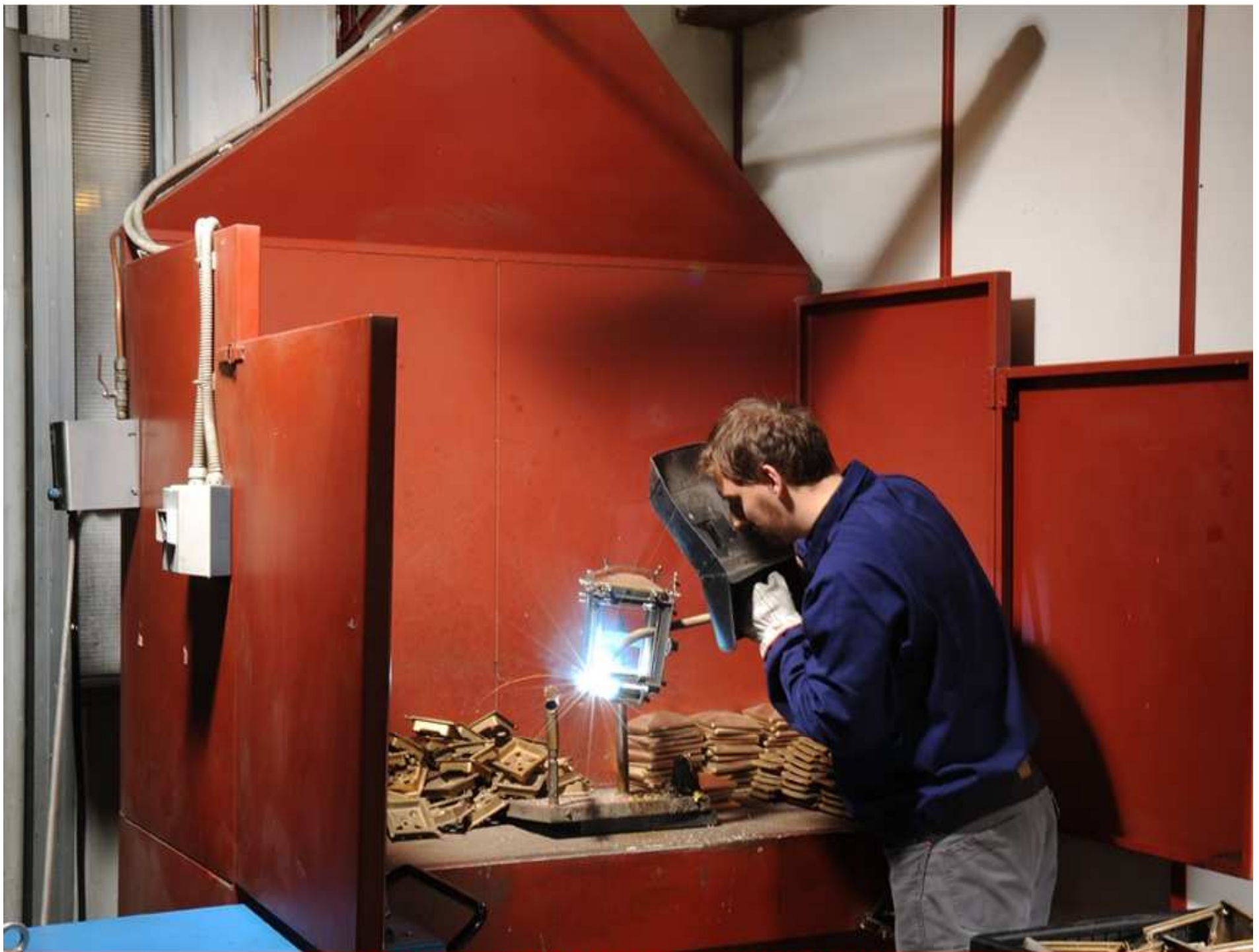
ASSEMBLY BRONZE DEPARTMENT