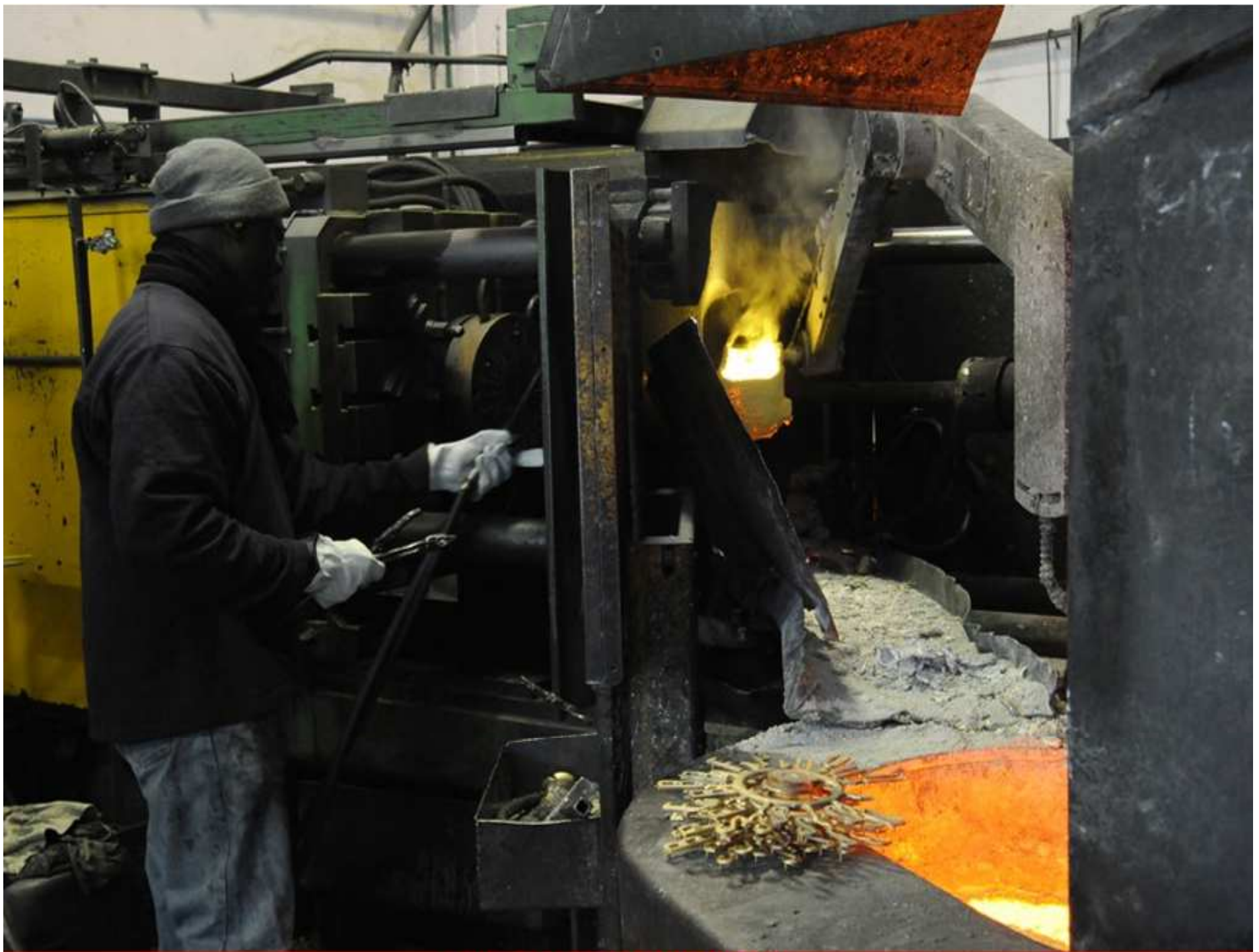
DIE CAST FOUNDRY