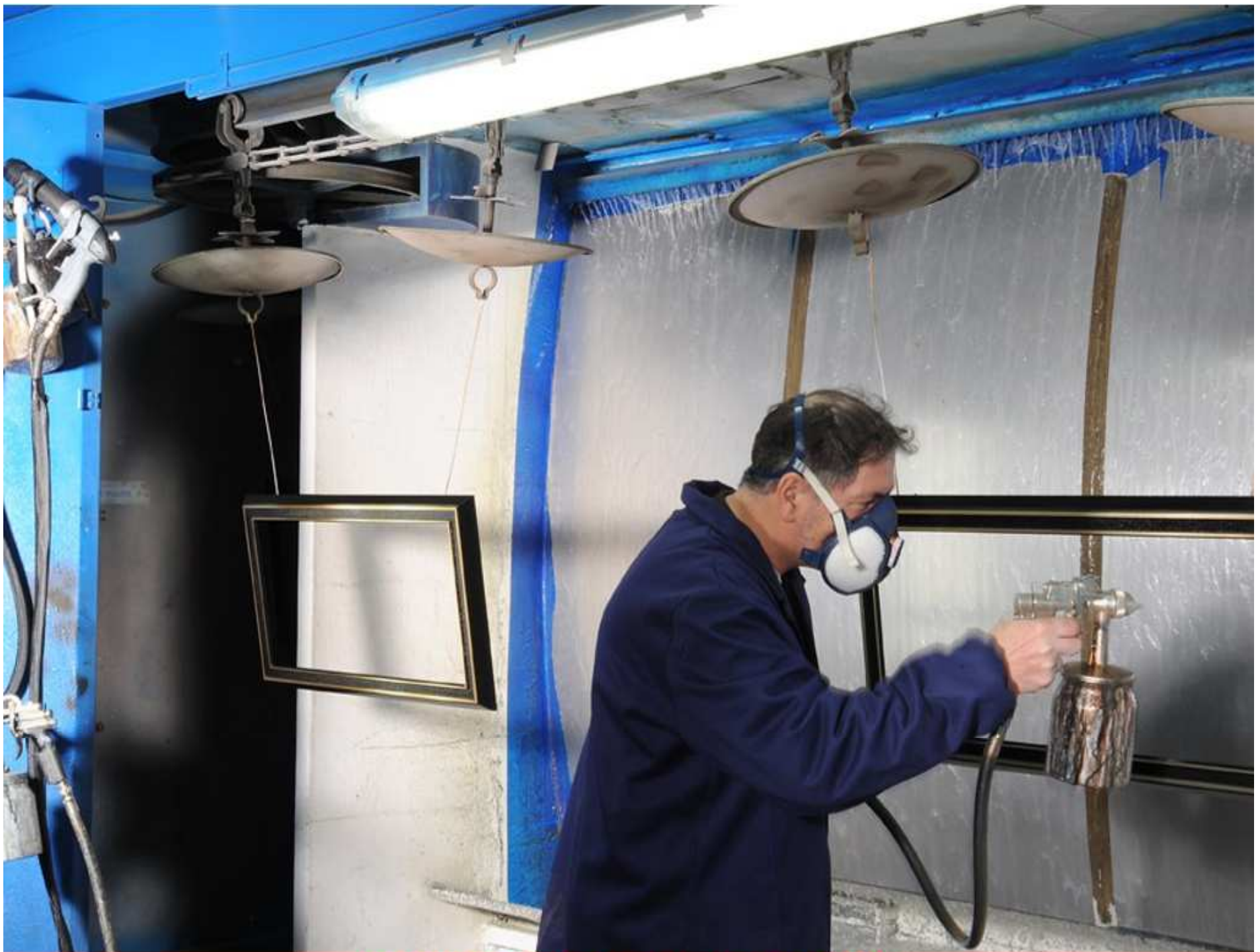
LIQUID COATING DEPARTMENT